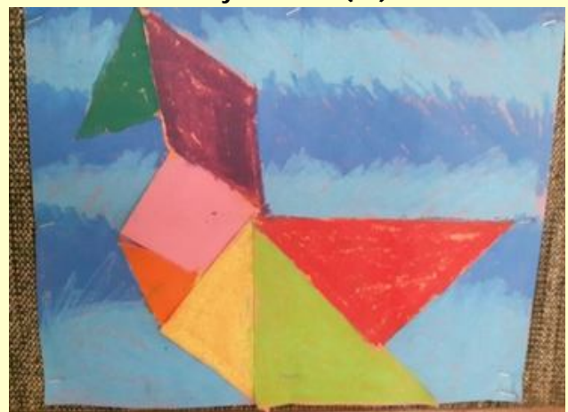
Jashvi Shah (III)