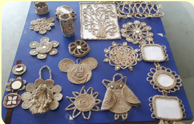
Playing with Jute threads (VIII)